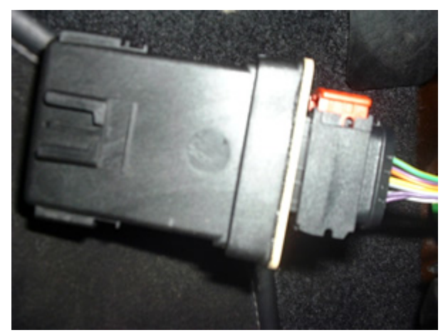
Once you have the unit out you will see a RED clip holding the harness to the 1929SJ Lift this up and gently pull the harness plug off the unit.

Carefully move obstructing wires out of the way gently pull the 1929SJ straight down so it disconnects from the housing.