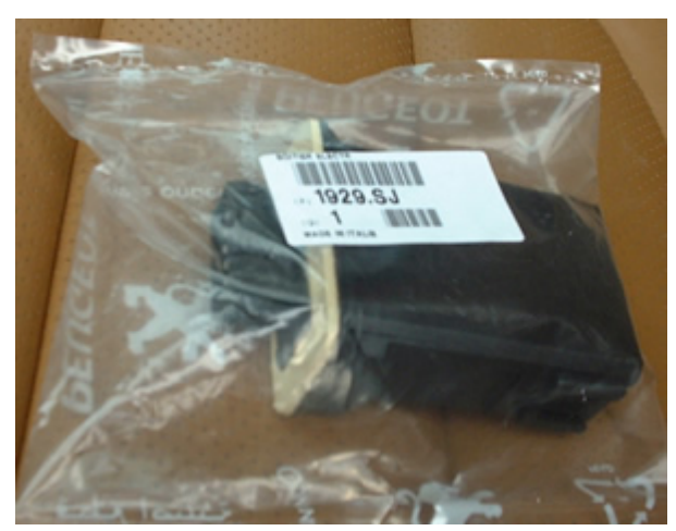
You will need:-